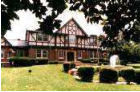
Kosair Charities - 1986-2001

clearly understood by staff, board members, donors, grantors and clients, that no one will be turned away from treatment at The Morton Center because they can't afford it.